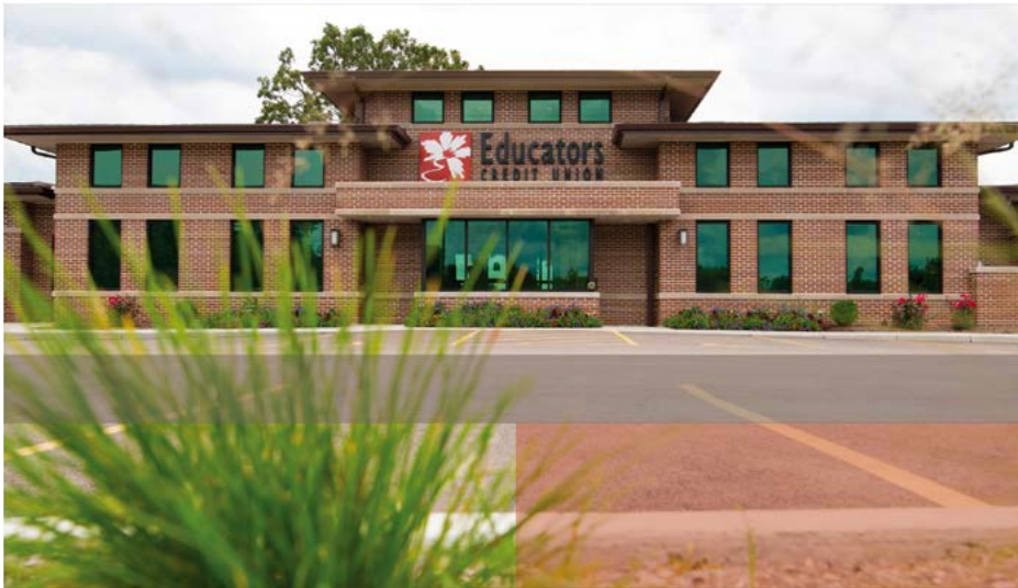
ECU branch in Pleasant Prairie, Wisconsin.